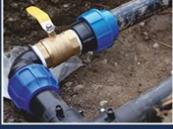
SEPARATE WATER LINE