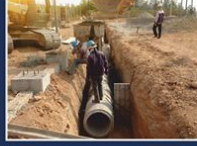
SEPARATE DRAINAGE LINE