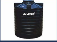
2000 LTRS WATER TANK