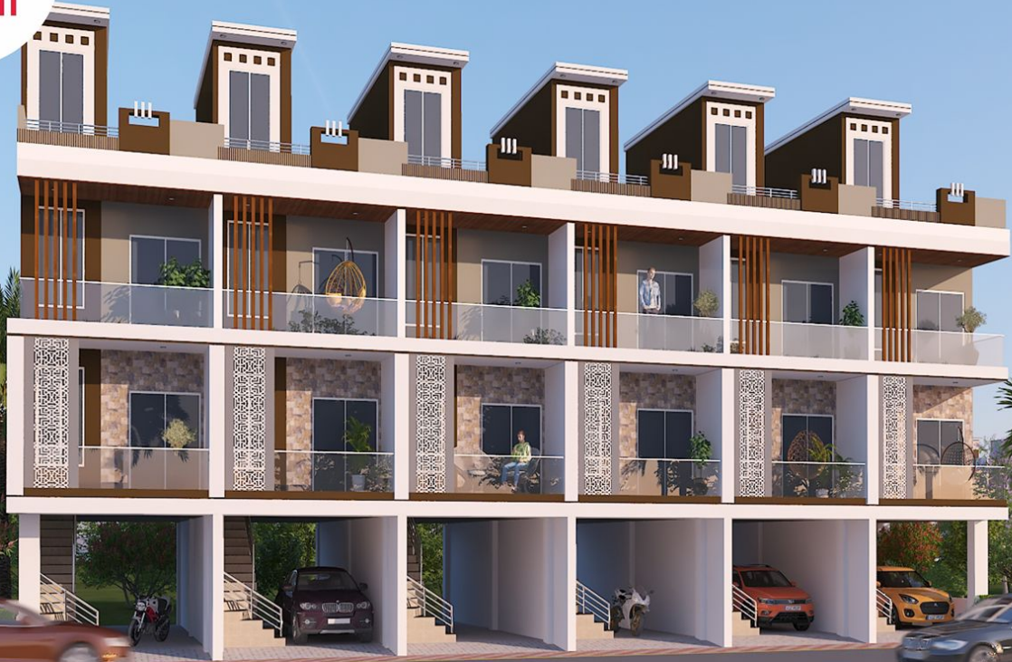
ROW HOUSE FRONT ELEVATION 3D VIEW