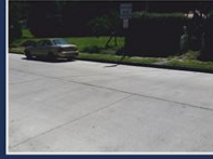
INTERNAL CONCRETE WAY