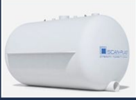
55000 LTRS SAFETY TANK